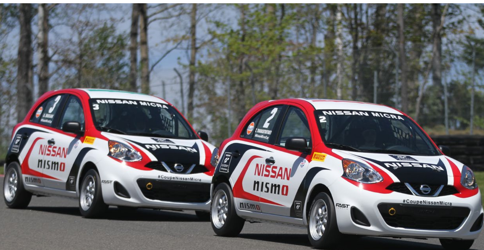
The Nissan GT Academy in the race in 2015, in the Nissan Micra Cup.

The year 2015 was not only the first for Nissan Micra Cup series. It was also marked by the arrival of international drivers from the Nissan GT Academy, made famous by the movie of the same name in 2023. The GT Academy was particularly well represented during the first seasons of the series.